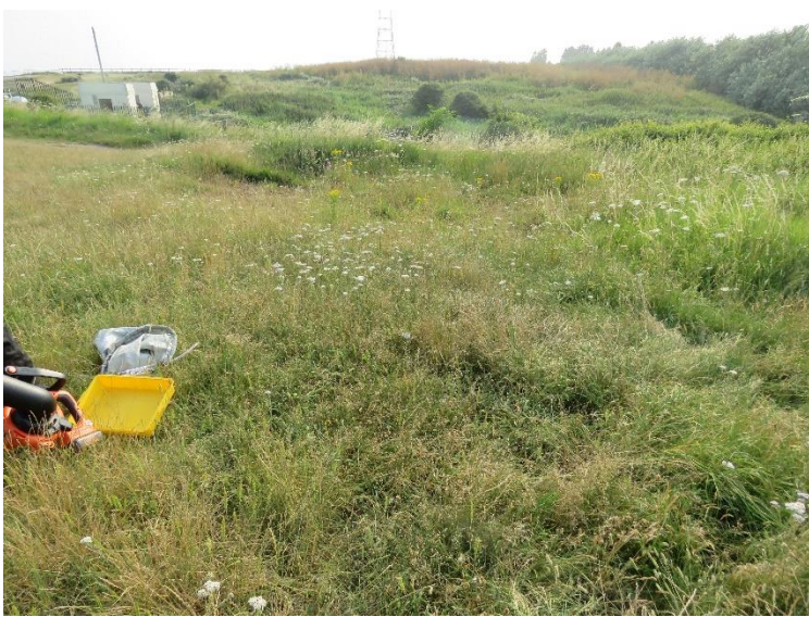
Figure 6. Terrestrial station 5.