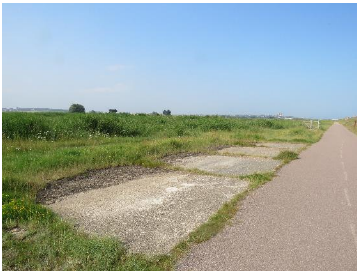
Figure 3. Terrestrial station 2.