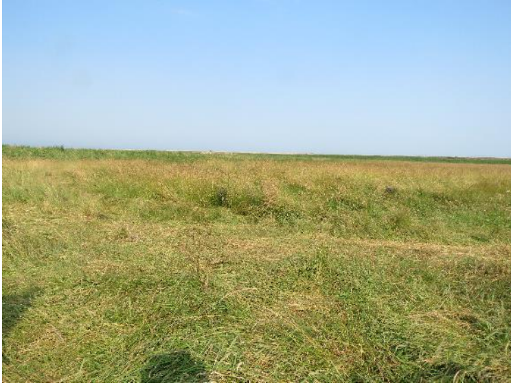
Figure 5. Terrestrial station 4.