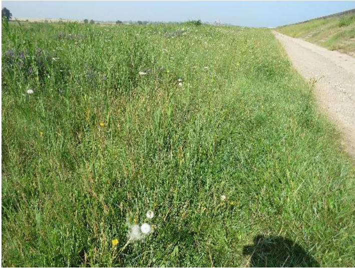
Figure 2. Terrestrial station 1.