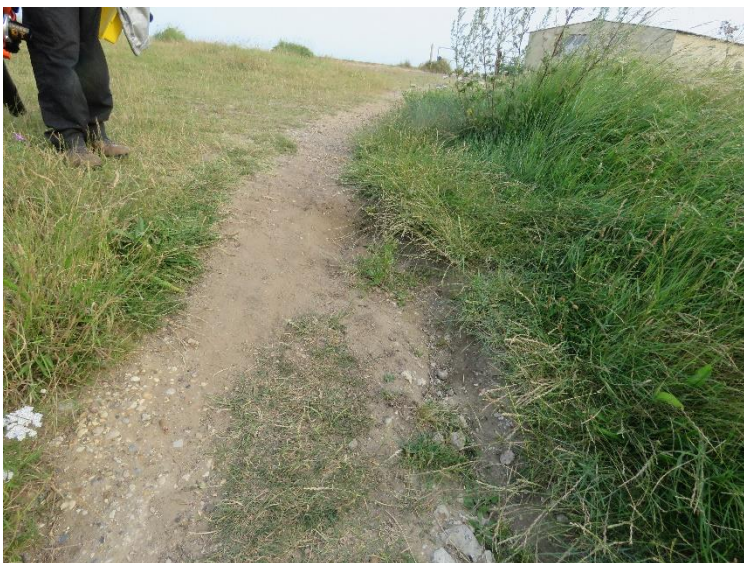
Figure 7. Terrestrial station 6.