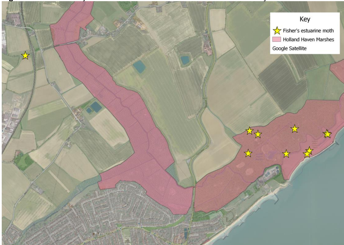
Figure A3:1. Desk study records for Fisher's estuarine moth within the survey area.

These records are attributed to 'Natural England Fishers Estuarine moth monitoring' and include estimates of the percentage of plants at a locality with feeding signs. The records are dated 2005, and then 2011-19. It is not known if the records represent a systematic search for evidence of the moth or are based on visits to 'known' or 'pre-determined' locations.