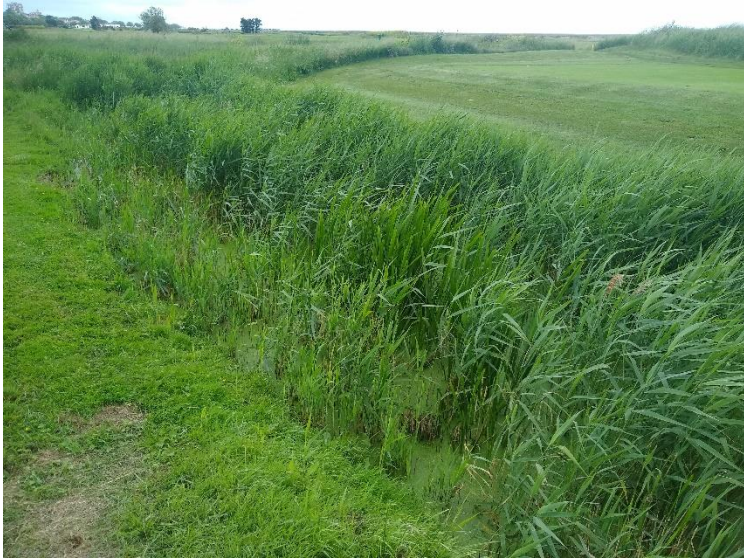
Figure 8. Late seral stage ditches.