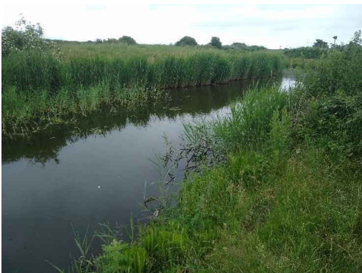
Figure 10. Holland Brook, station 11.