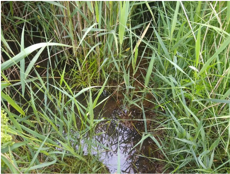
Figure 9. An example of the limited extent of open water within late seral stage ditches.