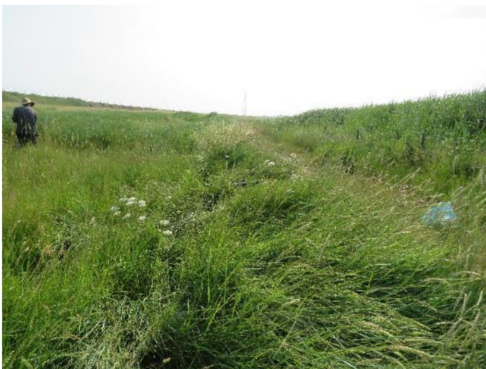
Figure 4. Terrestrial station 3.